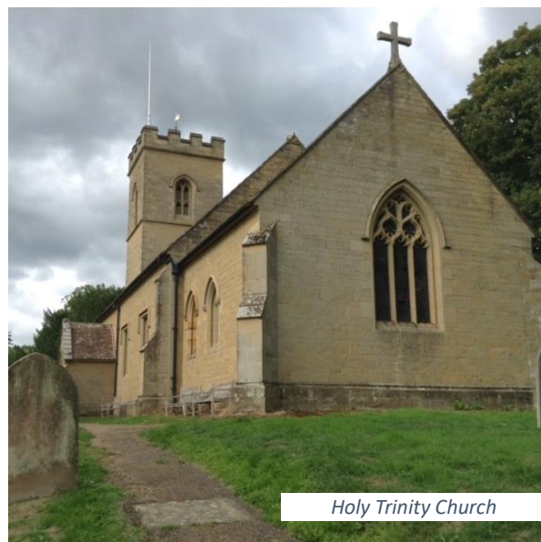
Holy Trinity Church

Beyond the screen we find the Copeman Hart Organ consol and stalls for a small choir. The chancel houses the altar and features a reredos. Beside the altar is a memorial to Octavia Hill, the social reformer and cofounder of the National Trust. Octavia is buried with her sister in the beautiful, well-kept churchyard, which has recently been extended due to a gift of adjoining land.