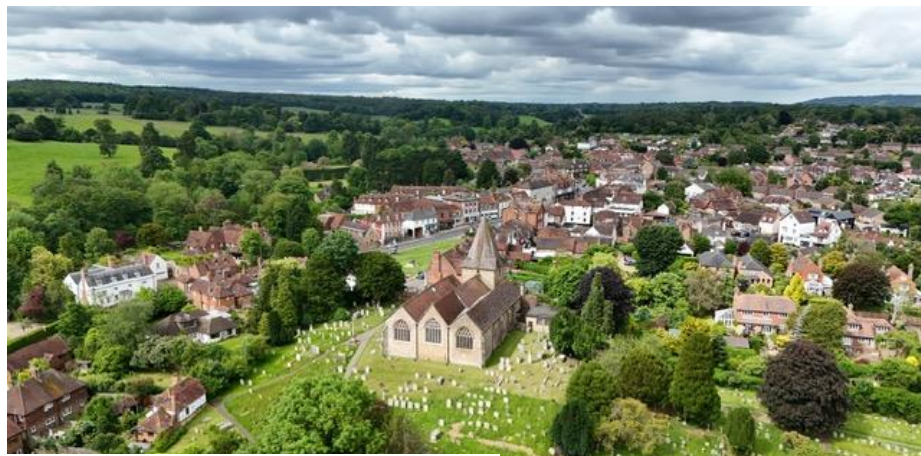
St Mary's from the air

Both churches are open daily, loved and cared-for by many members of our local communities. Visitors, of which there are many, comment on the special atmosphere of each. Some of those visitors are simply passing through but others make special journeys to visit us.